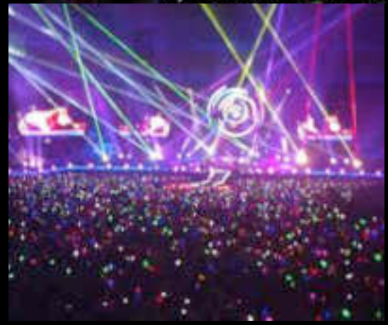
• XyloBands on tour with Coldplay

Coldplay fans have experienced XyloBands - 99% to 100% Capacity crowds in 86 stadiums on 4 continents, Coldplay deepens its fanbase loyalty with each show.